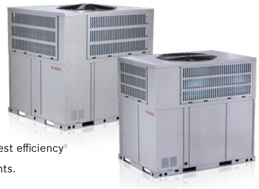
IDP PREMIUM AHRI 210/240 PERFORMANCE DATA