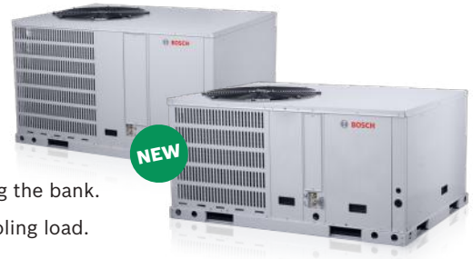
IDP PLUS AHRI 210/240 PERFORMANCE DATA