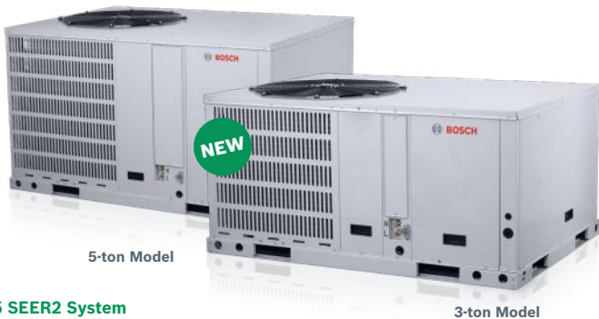
15 SEER2 System IDP Plus

Meet the Bosch IDP Family. Featuring all of the benefits of the Bosch Inverter Ducted Split systems in a single package, the IDP offers best-in-class efficiency and comfort. Each system in the IDP Family delivers premium comfort and performance by adjusting compressor capacity rather than a simple on/off control like other traditional units. This customizable feature allows you to bask in comfort while still reducing operating costs and saving money. The system also works seamlessly with your thermostat to automatically adjust to your preferences. Plus, integrated sound dampening features keep the unit nice and quiet all day long.